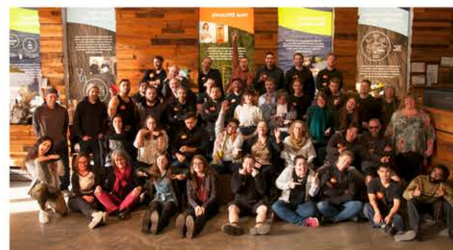
Sustainability Trust Class of 2021